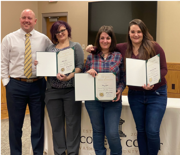
Pictured: Recovery Court Graduation

The Misdemeanor Probation Program at CCI offers essential services and supervision to individuals sentenced by local General Sessions and Criminal Courts for misdemeanor offenses. Our programs aim to divert these individuals from incarceration by providing structured rehabilitative services and supervision within the community.